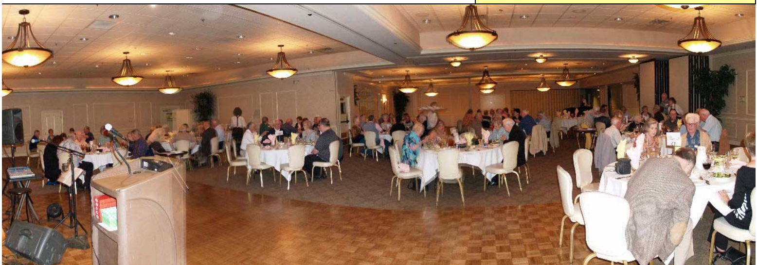
Ladies Day Gathering at Pardini's on May 14