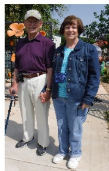
CLOVIS BOTANICAL GARDENS APRIL 22, 2015 BASKIN-ROBBINS